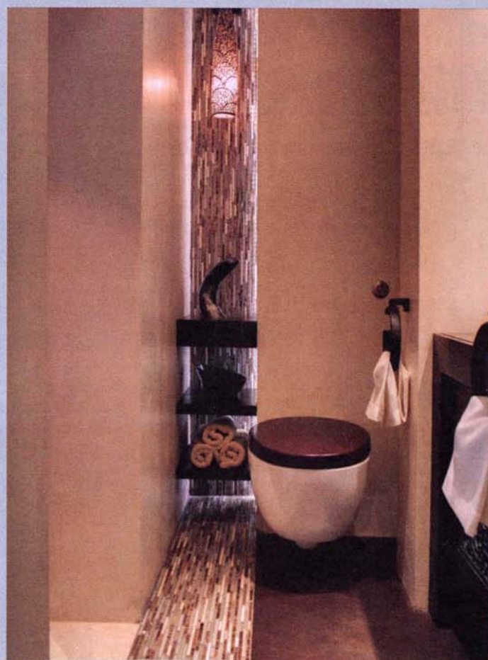
Effective use of space